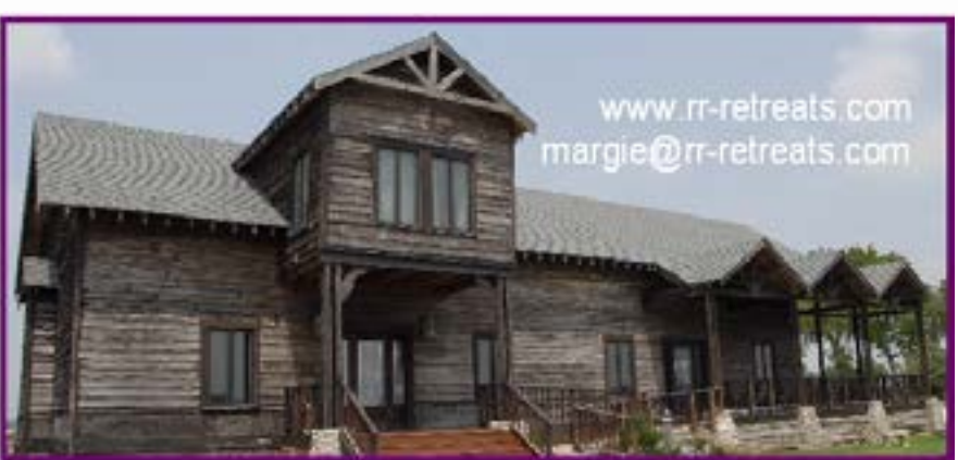
15% discount on lodging for 10 minimum, Thursday - Sunday night now through November.