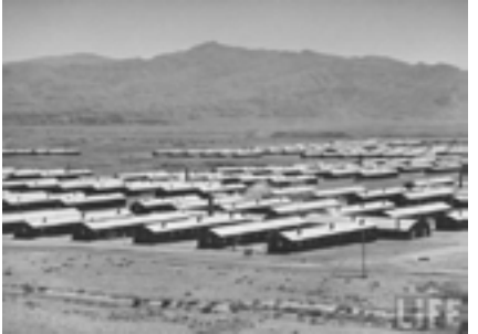
Camp for the Japanese in Arizona cross stitched their names on

In the 1940s, fourth grade students at Poston Relocation