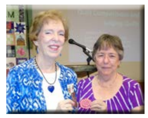
Check out the Bring and Brag items at www.sanantonioquilt.org

Click on the services drop down menu and the