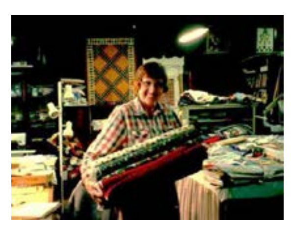
Owner & Operator General Store & Quilt Studio Converse, Texas