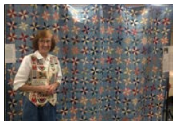
"Twinkling Stars Over Texas" Featured in first edition of Great American Quilts 1987