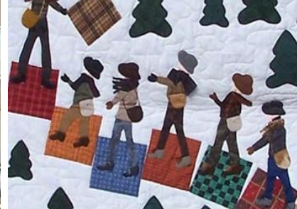
Panguitch which is included in her album 'Little Crazy Quilt.'