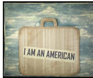
One Suitcase (24" x 18") by Carol Kolf. From the exhibit Fabric of Memory .