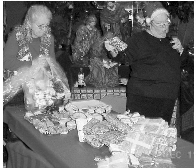
Wonderful Fat Quarter Prizes Galore