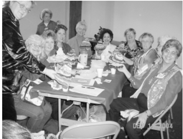
Eat, drink and be merry!