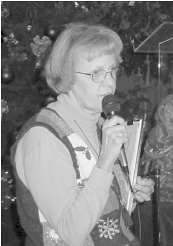
First Day on the New Job

On December 10 th , a meeting involving 20 volunteers from a number of quilting and sewing organizations throughout greater San Antonio took place at Central Market on Broadway. During the meeting volunteers who have generously given of their talent, time, and energy in support of the upcoming exhibition at the Institute of Texan Cultures were acknowledged. In addition, those present divided into groups to discuss a number of activities that will be demonstrated during the Transcending 9/11: Quilters' Reflections exhibition. These crafts include Temari Thread Balls, Sashiko, Folded Fabric Flowers, and Origami, as well as additional activities appropriate for children. Group leaders were identified and "how to make" sessions for each of the different crafts are being scheduled for early January. If you would like to attend any or all of these meetings, learn how to make these beautiful craft items, and help prepare kits for demonstrators, please let us know and we will send you the details. Barbara Gilstad ( Gilstad@texas.net ) or Ruth Felty ( ruth_felty@msn.com )