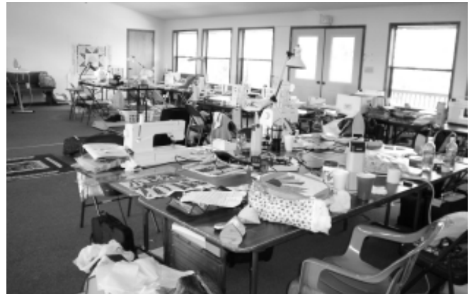
Out to Lunch, sewing machines cooling off.