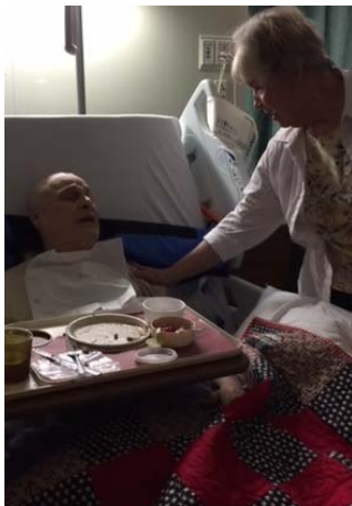
Kino T.—Air Force