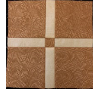
Layers of Fun

In September we introduced a new block, Layers of Fun. This block goes together easily. This pieced block complements an alternative block to make an awesome quilt. Stop by the QPC table to see both blocks. And check out a block or two.