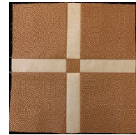
Layers of Fun