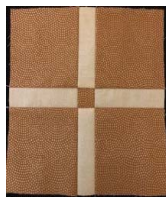
Layers of Fun