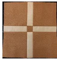
Layers of Fun