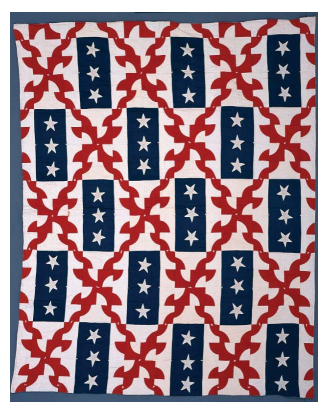
Stars and Stripes (73" x 76") c. 1900, artist unknown. From the exhibit Red, White, & Blue .