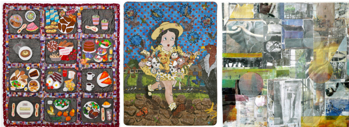
Quilts from l to r: Last Suppers (66" x 69") by Jane Burch Cochran; The Collector (45" x 60") by Wendy Huhn; and Lens Flare (31" x 31") by Joan Schulze.

September 7, 2021—LA GRANGE, TEXAS—The Autumn/Winter exhibits at the Texas Quilt Museum once again showcase the variety and breadth of the art form with three very diverse offerings. The exhibits will be on display from September 23-December 19, 2021 not only during normal hours, but also extended times when the Museum is open every single day from October 21-31 (10 am-4 pm) during Houston’s International Quilt Market and International Quilt Festival.