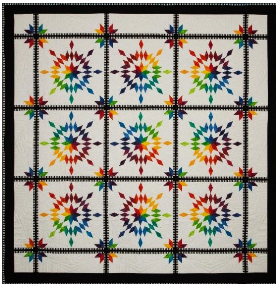
Luminosity 76" × 76"

Drawing May 6. Need not be present to win!