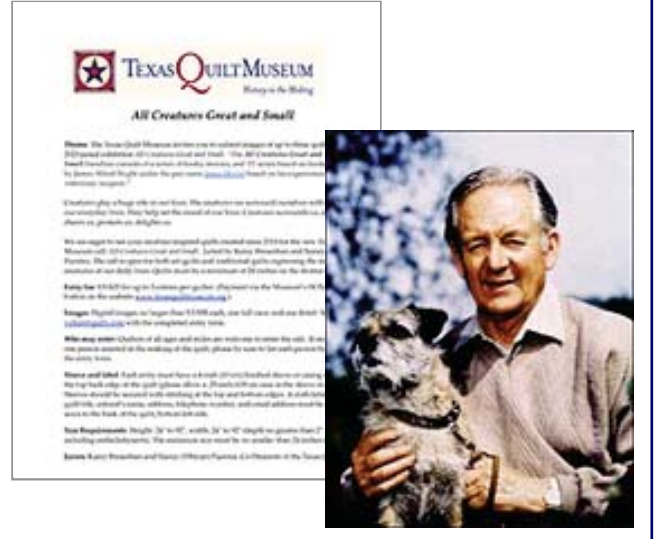
James Alfred Wight

View full PDF for more submission info »