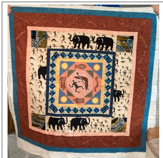
# 179 Petroglyphs – a medallion Round Robin circa 1990